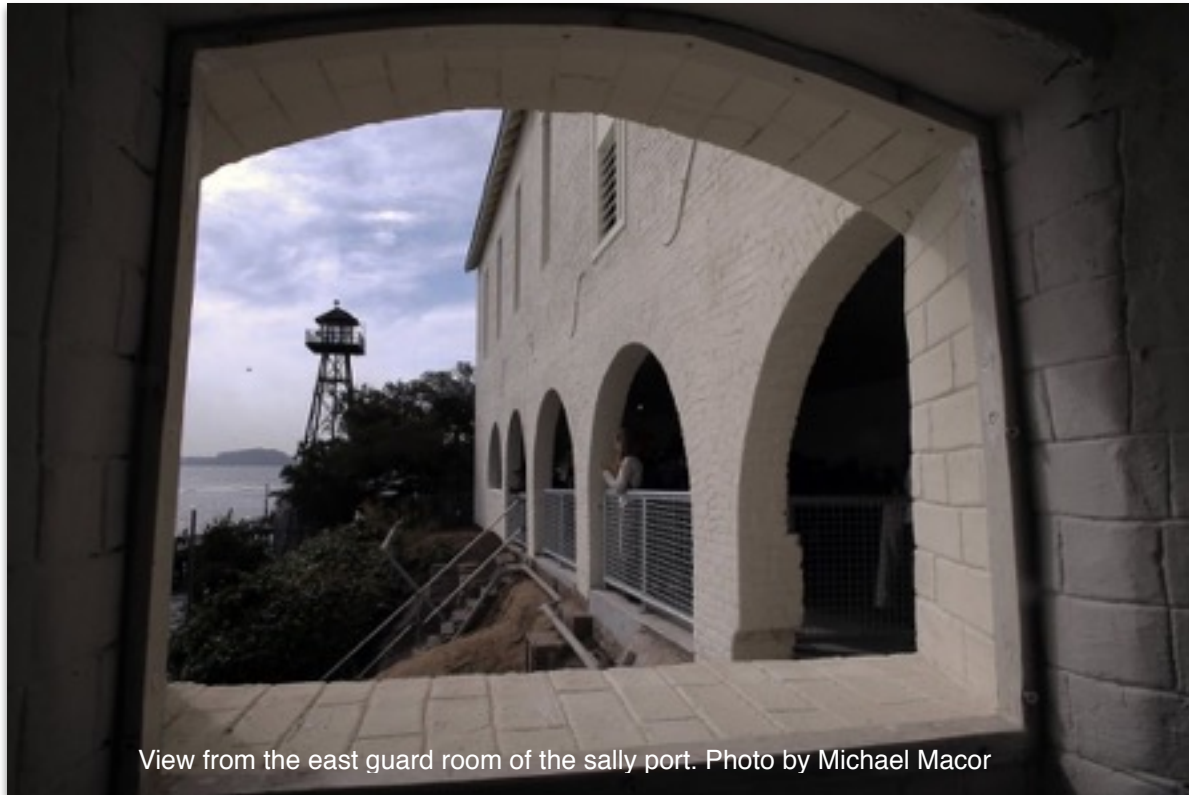
View from the east guard room of the sally port.

Alcatraz taken from the Chronicle's files. The article can be found at http://www.sfgate.com/bayarea/article/Renovation-opens-up-earlier-pre-prison-history-6361610.php