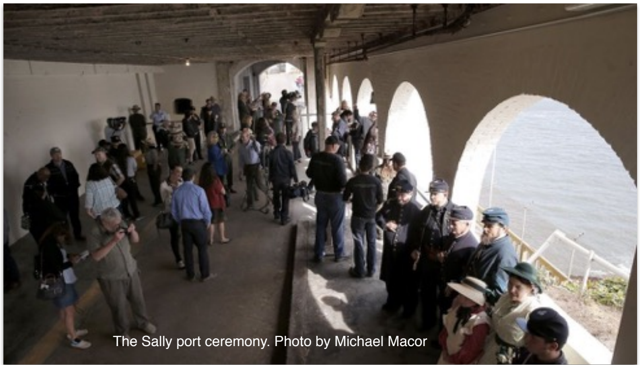
The Sally port ceremony.